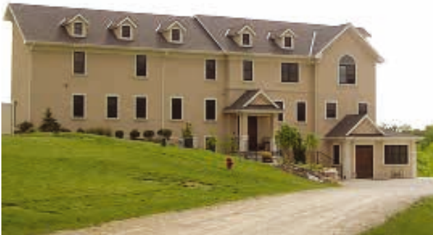
The new District House in Platte City, MO.