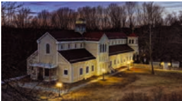
Christ the King Church in Ridgefield, CT.