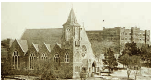
Immaculata Chapel at St. Mary's Academy and College in St. Mary's, KS.

He left the SSPX in confused times but always remained respectful towards it and faithful to his priesthood. He reestablished contact with the U.S. District during his last months of the cancer which called him to Our Lord in 2012. The faithful of the chapels he served then asked assistance and service from the Society.