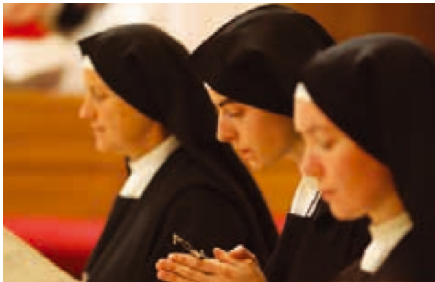
Profession ceremony of the Sisters of the Society of St. Pius X.

The first Sisters of the Society of St. Pius X arrive in St. Mary's, KS.