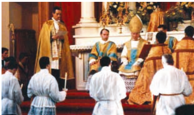
Priestly ordinations in 1985 at Ridgefield, CT.