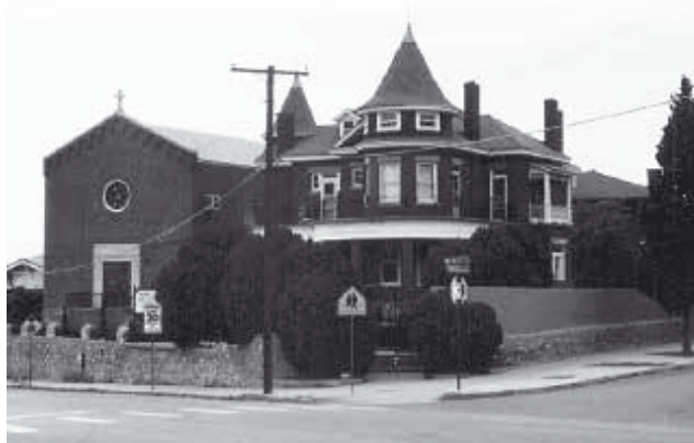
The Brothers' Novitiate in El Paso, TX.