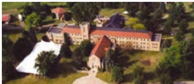
St. Thomas Aquinas Seminary in Winona, MN.

1987 Jesus and Mary Academy in El Paso, TX opens its doors.