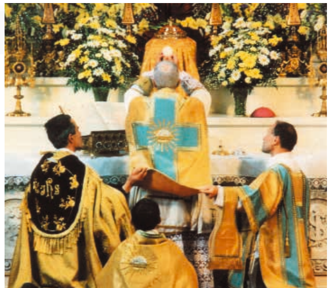
Archbishop Lefebvre at Ridgefield, CT in 1985.

Marcel Lefebvre, Paris, September 23, 1979