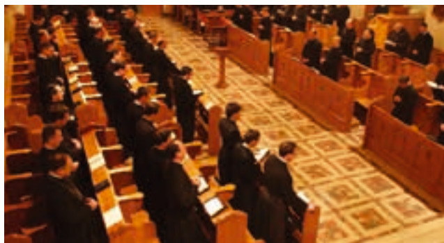
Seminarians and priests at St. Thomas Aquinas Seminary in Winona, MN.