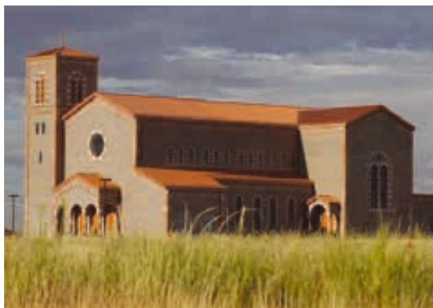
St. Isidore’s in Watkins, CO.

St. Mary’s College in St. Mary’s, KS begins a traditional Catholic radio station: KSMK-LP at 98.3 FM.