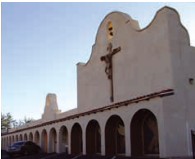
Our Lady of Sorrows Retreat House in Phoenix, AZ.