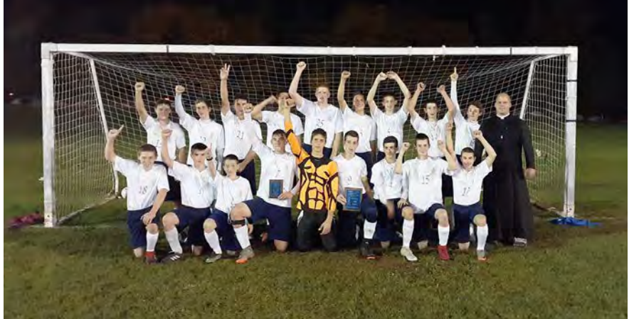
The soccer team from Mater Dei Academy in Warners, NY won the Old Forge Tournament again!

Students from Mater Dei Academy in Warners, NY (formerly Blessed Virgin Mary Mother of God Academy) landscaped the courtyard, putting in paths and flower gardens.