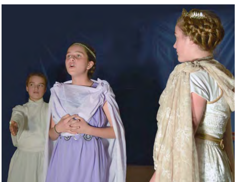
As a part of their annual School Spirit Week, the students at St. Joseph's Academy in Ray Township, MI competed for awards for the best medieval costume and the craziest hat.

The Spring Pageant at St. Joseph's Academy (MI) included a performance of the Greek tragedy, Iphigenia in Aulus by Euripides by the 5th and 6th grade classes.