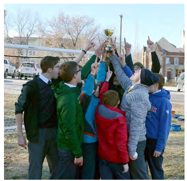
At St. Vincent de Paul Church in Kansas City, The North American Martyrs Intramural Whiffle Ball Tournament was won by the Flying Antelopes, defeating the Ugly Ducklings 21-19.