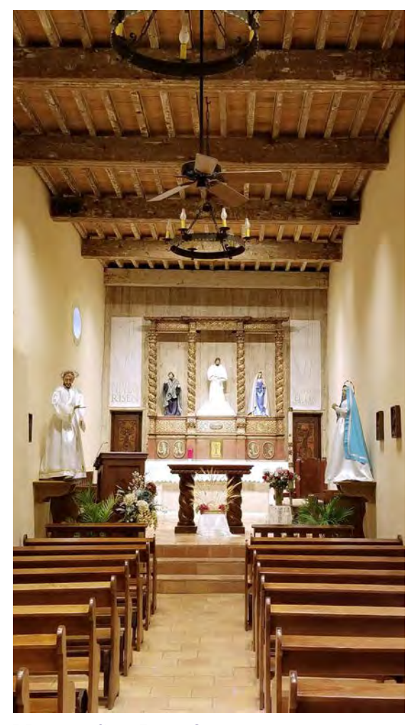
Mission San Juan Capistrano was founded in 1731 by Spanish Catholics of the Franciscan Order on the eastern banks of the San Antonio River. The first primitive capilla (chapel) was built out of brush and mud.

A small but zealous group of faithful undertook the San Antonio Missions Pilgrimage on Saturday, May 18, 2019. The pilgrimage began at Misión Nuestra Señora de la Purísima Concepción de Acuña which was established in 1716 in East Texas. Founded by Franciscan friars, this is the best preserved of the Texas missions.