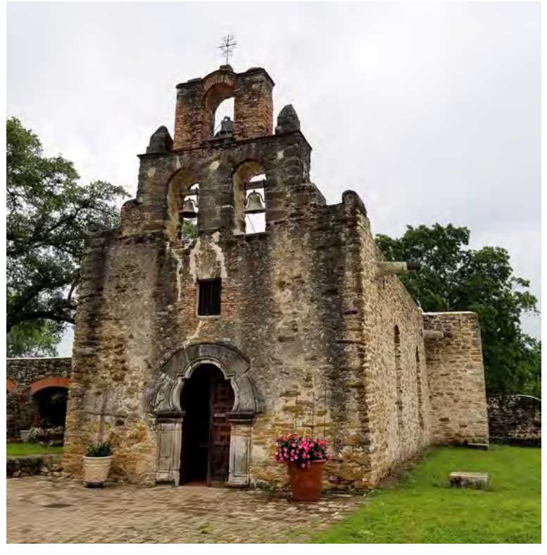
Misión San Francisco de la Espada was established in 1690 near present-day Augusta, TX and was a welcome sight for the weary travelers at the end of the pilgrimage.