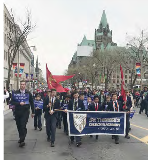
On May 9, 2019, St. Therese Academy in Nicholville, NY made the trek north of the border to participate in the Canadian March for Life in Ottawa, ON.

High school girls from Mater Dei Academy in Warners, NY at their monthly outing praying for the unborn outside Planned Parenthood.