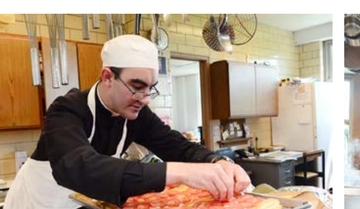
Three Brothers from Holy Angels Novitiate work on their "thesis meals" after spending a year studying the art of cooking. The Novitiate comprises postulants, novices, and 1st-year professed in a 3-year formation.