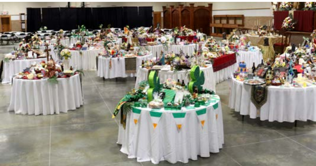
An abundance of items—religious, decorative, artistic, and culinary fill numerous St. Joseph's tables in St. Mary's, KS.