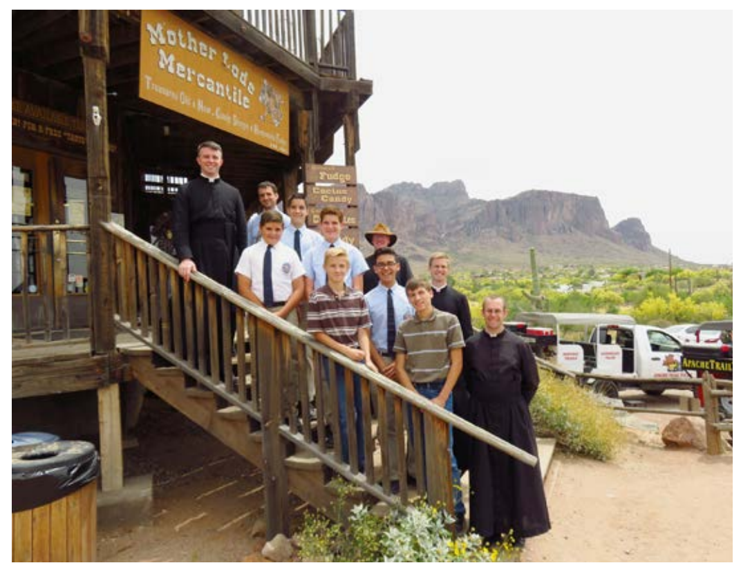
The high school boys from Our Lady of Sorrows recently enjoyed a field trip to an old mining town east of Phoenix, AZ.