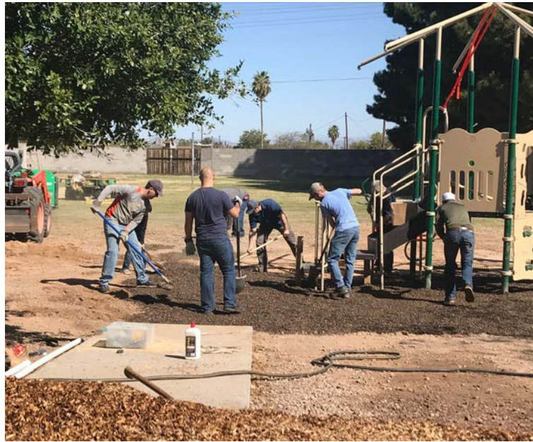
Parents and parishioners of Our Lady of Sorrows in Phoenix, AZ recently began an effort called "Project Play" to rejuvenate the school's outdoor play area. A local commercial playground dealer was willing to donate a used playground set to the school as long as transportation and installation was provided. $10,000 was raised and parish volunteers shoveled wheelbarrow after wheelbarrow of rock, raked woodchips, dug out trees, and installed the equipment.