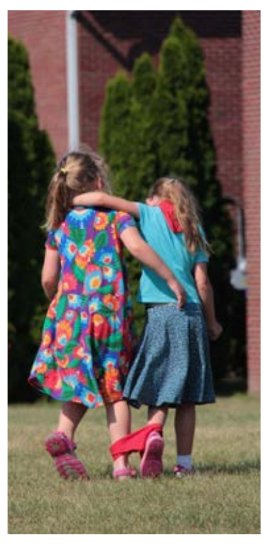
Two young Crusaders join forces in a three-legged race. during Crusader Camp at St. Joseph's in MI.