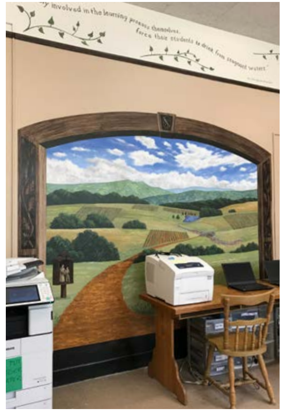
At Mater Dei Academy in Warners, NY, a parishioner took the time to beautify the walls of the teachers' lounge with a hand-painted mural.