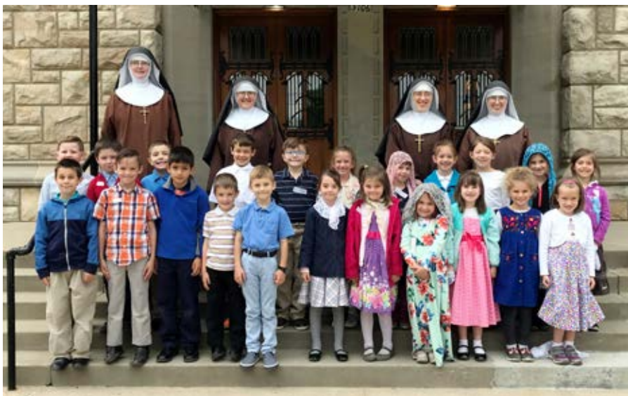
The first communicants at St. Vincent de Paul in Kansas City, MO had a day of recollection with the Franciscan Sisters on May 11, followed by a joyful First Holy Communion Day on May 12.