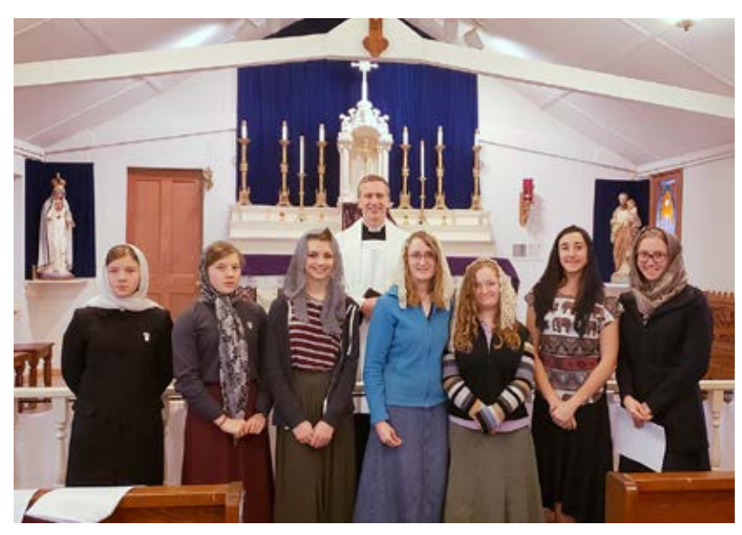
The Children of Mary at Our Lady of Fatima Church in Portland, OR held a probation ceremony for new members of this important apostolate.