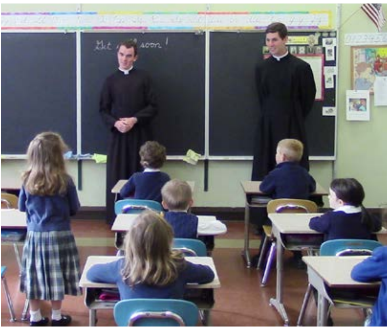
Seminarians from St. Thomas Aquinas Seminary address the kindergarten class at Blessed Virgin Mary Academy in Warners, NY on the Monday morning after their Good Shepherd Sunday visit.