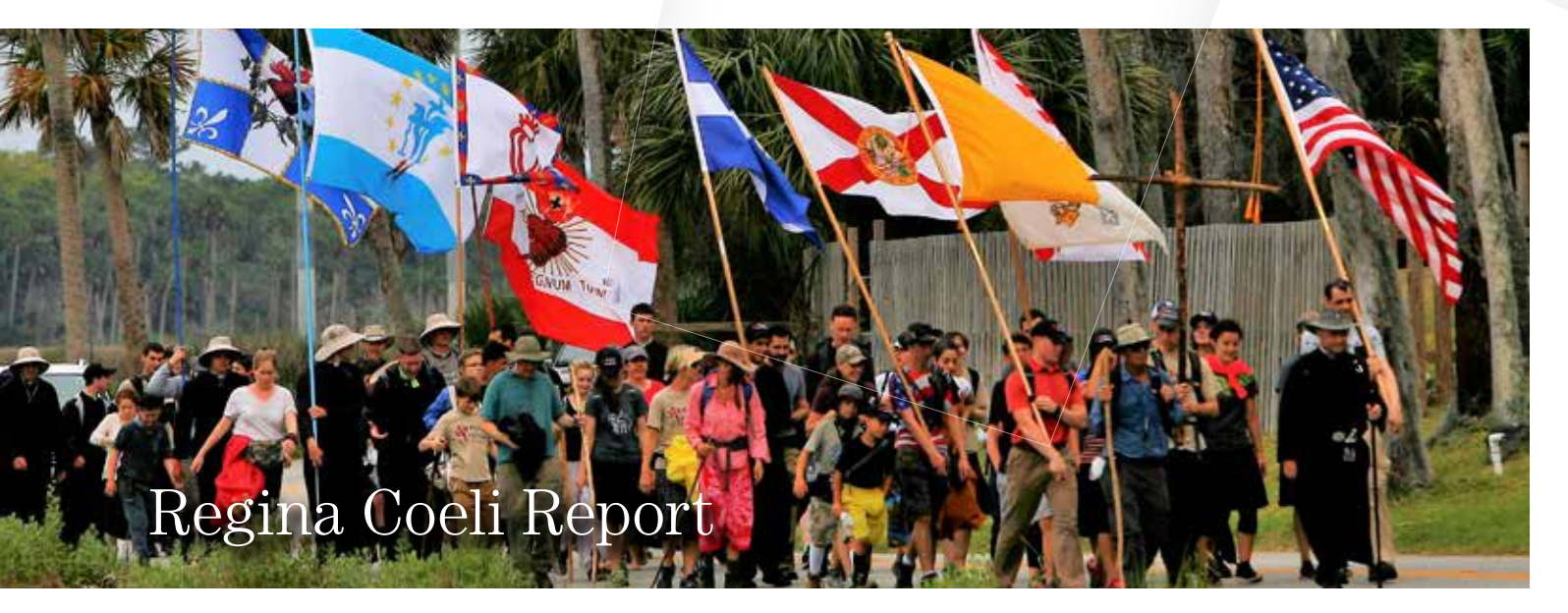
Number 292 February - March 2020 ::