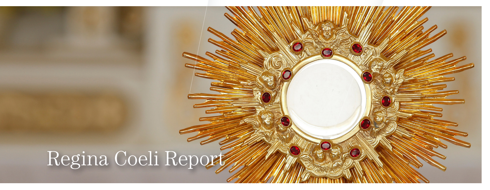
Number 291 December 2019 - January 2020 ::