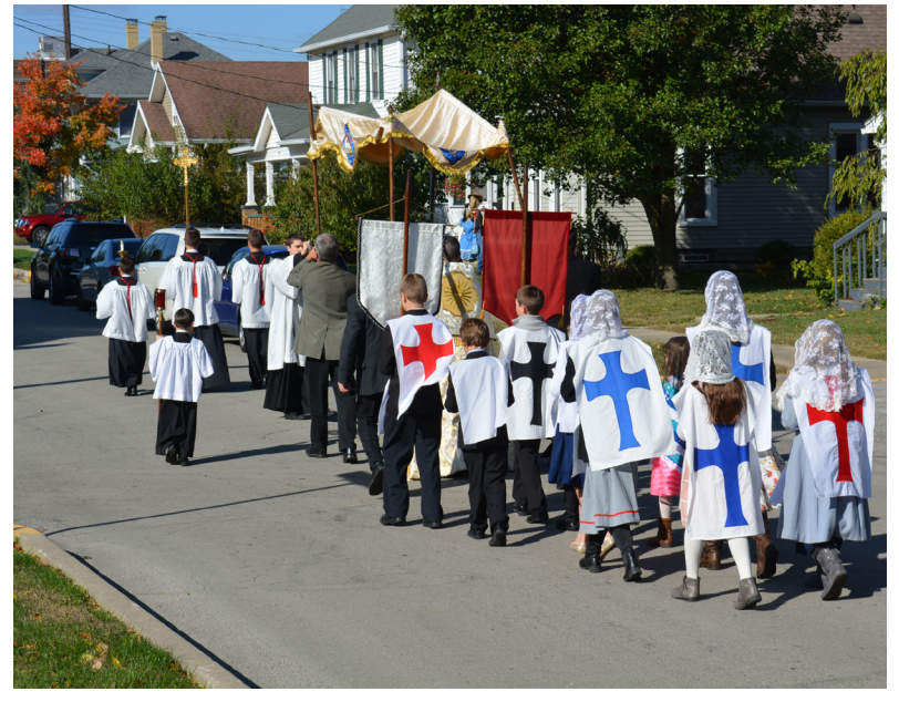
At St. Joseph's Church in Greenwood, IN, following Sunday Mass on the Feast of Christ the King, the clergy, the faithful and particularly the children of the Eucharistic Crusade witnessed, at least a street at a time, that Christ is King of both Heaven and earth.

A long column of parishioners from St. Joseph's Church in Ray Township, MI, braved the blustery weather for the annual Christ the King procession.