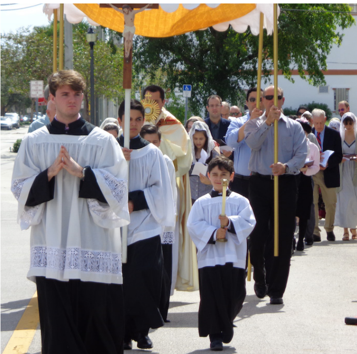
A Christ the King procession at Queen of the Most Holy Rosary Church in West Palm Beach, FL (above) and at St. Joseph's Church in Ray Township, MI (left).