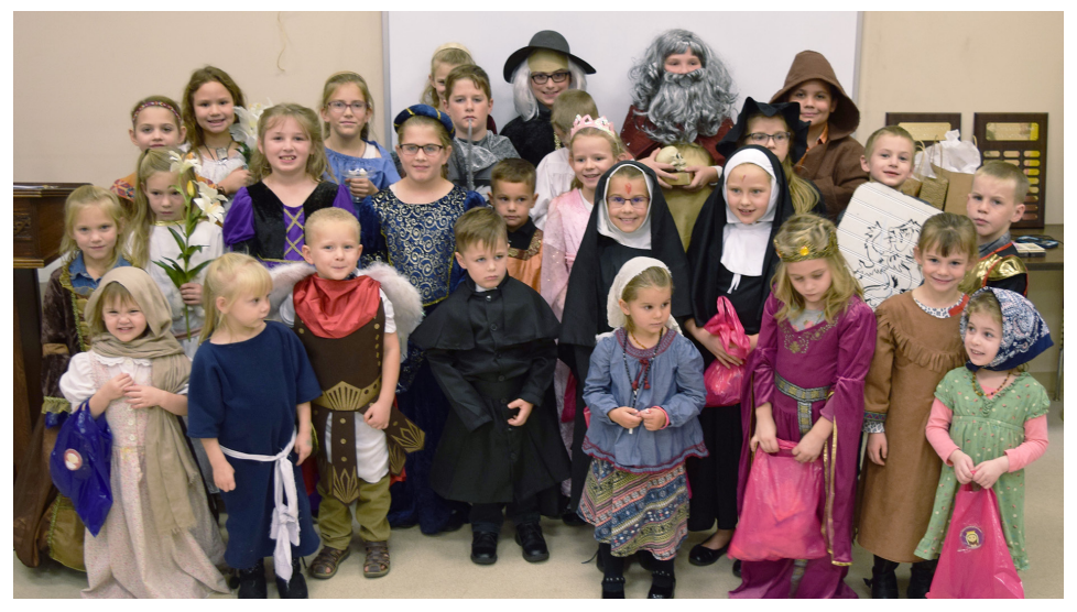
A selection of saints pose for a photo before the winners for best costume are announced at the St. Joseph's All Saints Day celebration in Ray Township, MI.