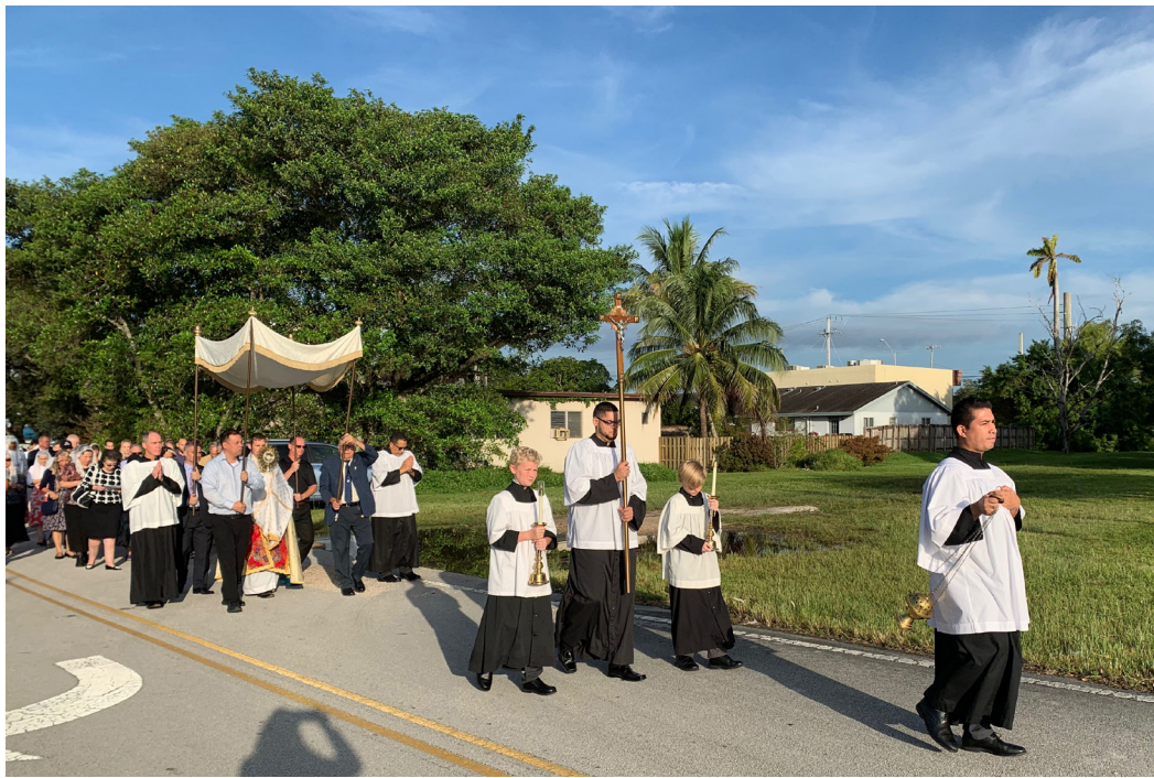
A Eucharistic Procession heads out to proclaim the Kinghip of Christ on a beautiful fall day in Mexico, MO.

Faithful from Our Lady of Victory Church in Davie, FL follow their Eucharistic King.