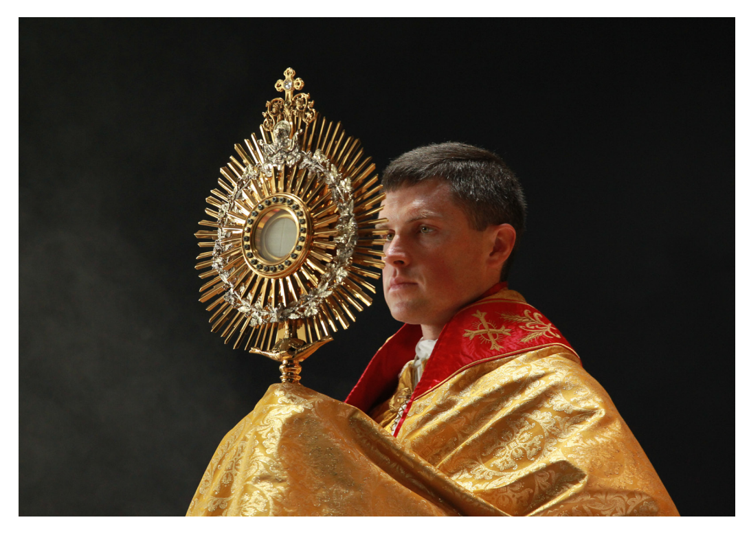
Benediction of the Blessed Sacrament at Blessed Virgin Mary Church in Warners, NY.