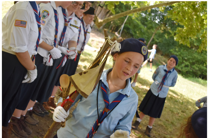
The leader claims her clan's award for winning the cooking competition: a carved wooden spoon to use on future camps!