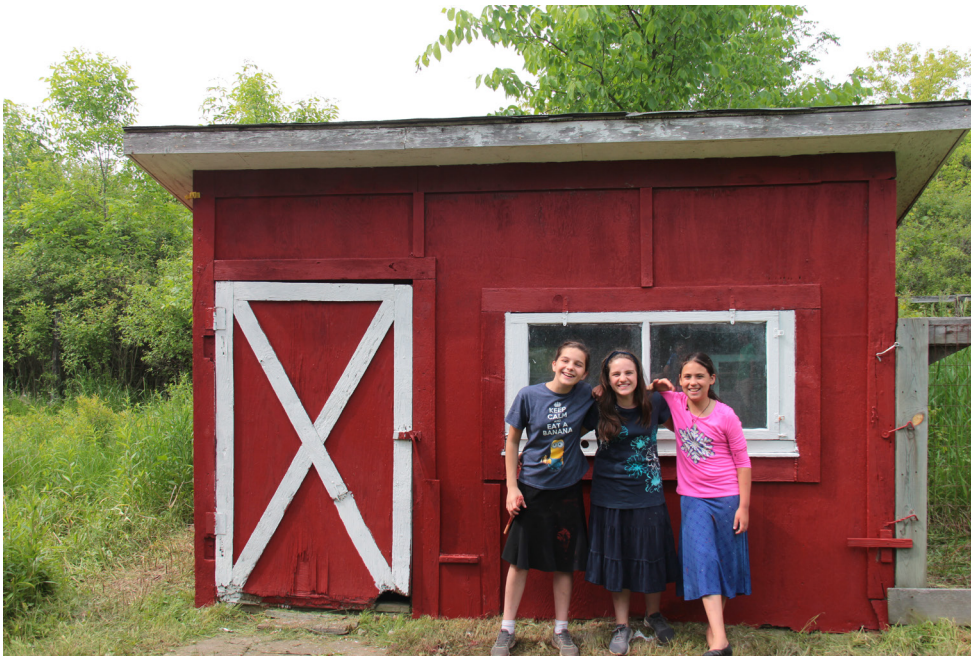
Parish teens in Armada, MI joined forces to help the priests at St. Joseph's with landscaping and beautifying the priory shed.