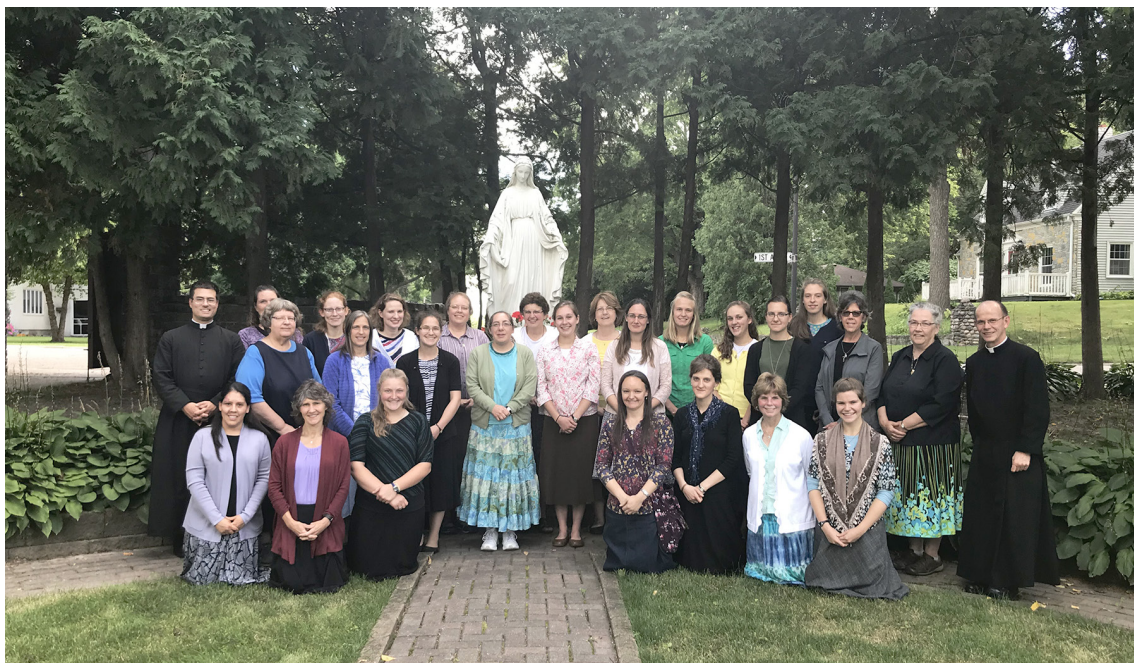
During the week of August 18, 25 women from the Minnesota parishes and as far away as Illinois and New Mexico attended a 5-day Ignatian retreat preached by some of the priests of the Browerville, MN priory. The retreat was held at the Christ the King retreat center operated by the Oblates of Mary Immaculate, on beautiful Buffalo Lake, Minnesota.