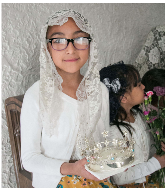
Young parishioners from Jesus and Mary Church in El Paso, TX crowned Our Lady during the month of May.