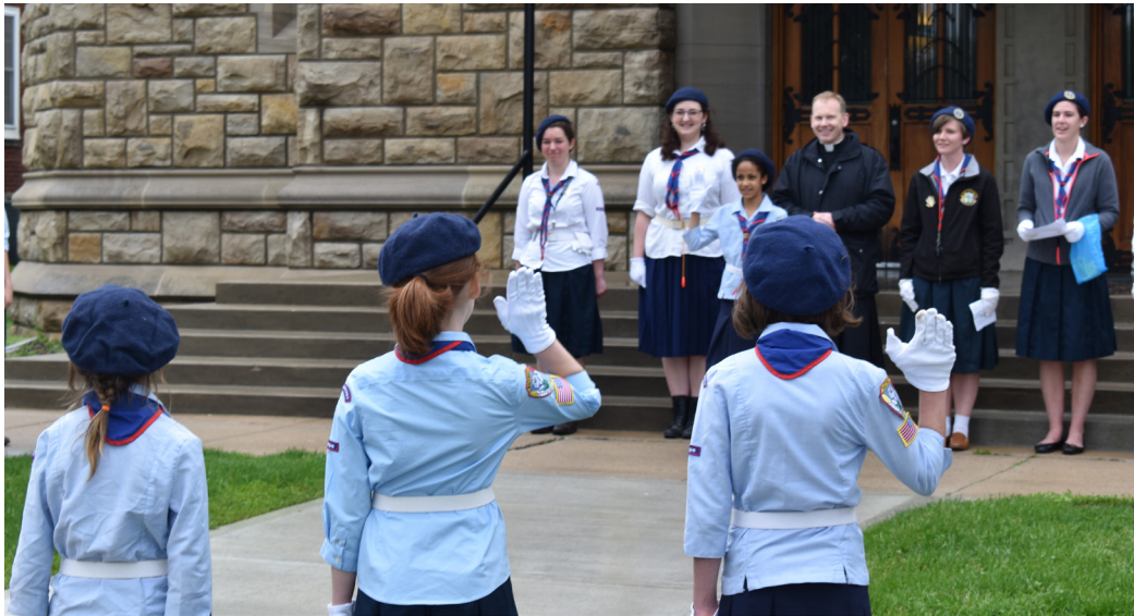
A new junior guide gives the salute after her solemn promise ceremony.