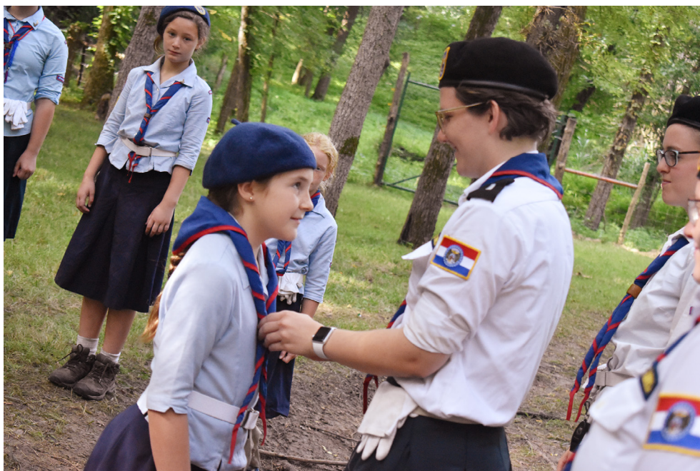
A Kateri, or junior guide, completes one of her first challenges: earning her neckerchief! She is now a novice in the scouts.