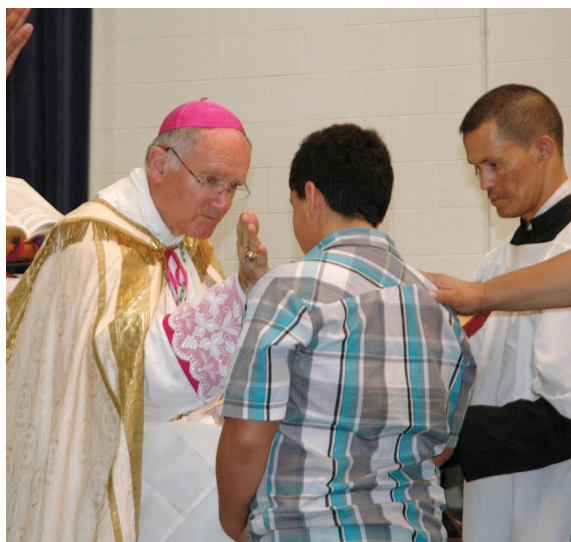
Bishop Bernard Fellay administered the sacrament of Confirmation to the faithful of Our Lady of Lourdes in Honolulu, HI on Our Lady's great feast day: August 15.