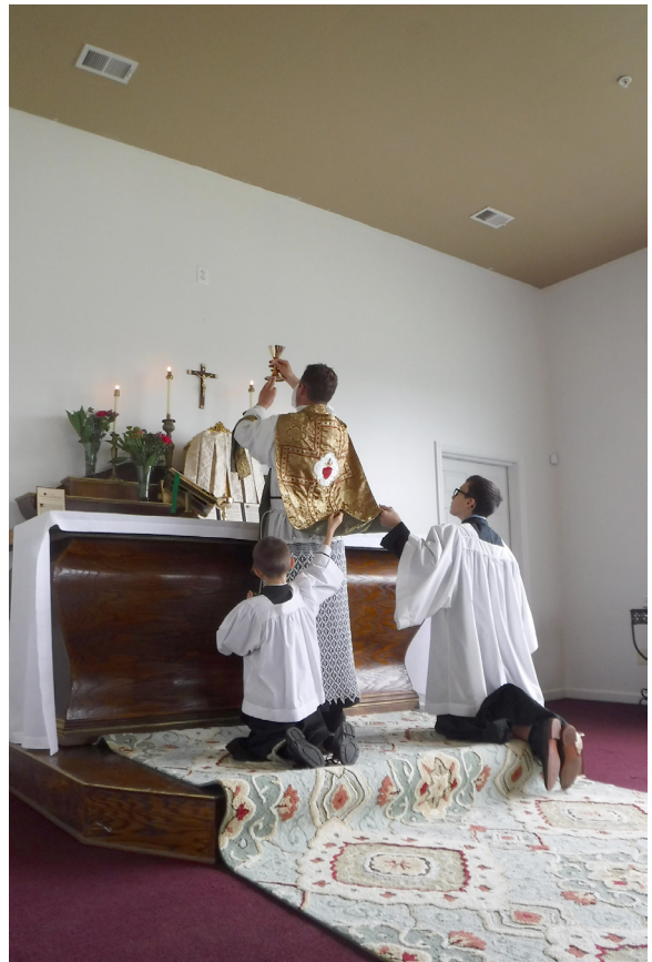
St. Pius X Mission in Washington, DC purchased a piece of property this summer and were blessed to have their first Mass at the new chapel on September 1.