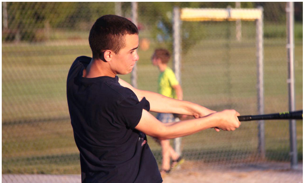
Family Sports Night at St. Joseph's Church in Armada, MI is a tradition dating back to the 1990s. Parish families gather each Wednesday evening throughout the summer for baseball, volleyball, conversation, and of course, pizza!