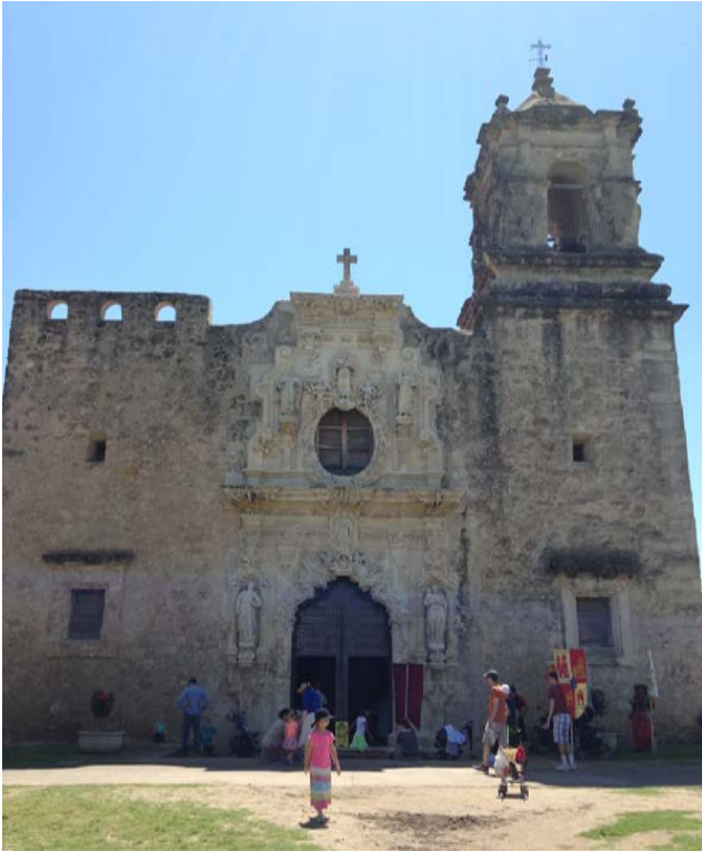
Members of Our Lady of the Blessed Sacrament parish in Corpus Christi, TX on the Mission Trail Pilgrimage in San Antonio, Texas