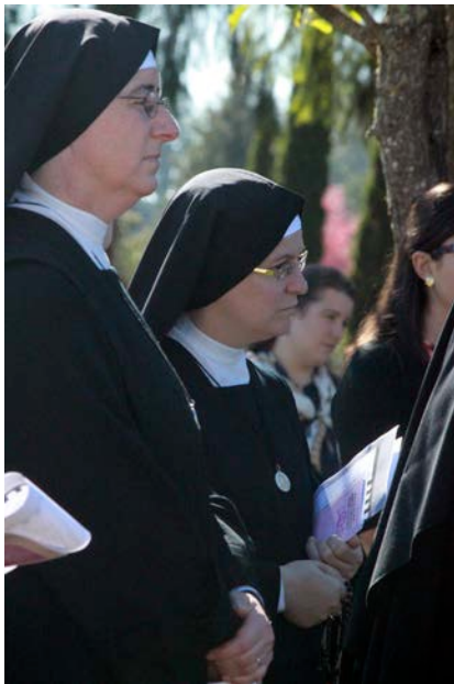
A group of faithful led by SSPX priests and sisters held a Rosary procession in Veneta, OR with the Fatima Pilgrim Statue. They blessed the town, praying for the good of the area and the riddance of evil.