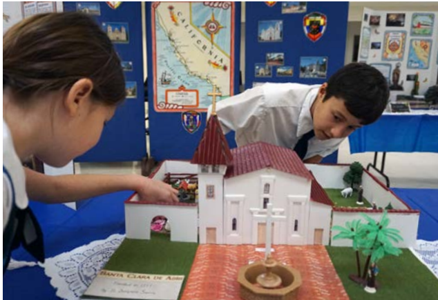
The fourth grade class at Our Lady of the Angels Academy in Arcadia, CA spent a quarter learning about the California Missions. Their presentations included a three dimensional model of one of the 21 missions founded by Fr Junipero Serra.