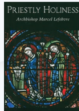
501 pages, hardbound – STK# 8545 – $31.95

Written firstly for priests, this beautifully leather bound volume from STAS Editions (Winona, MN) will find its place in traditional homes. In it, children will learn what a priest is; parents will know what to ask of God for their leaders; all will be edified by the sublime ideal traced for us by the man who, in the worse century of Church history, salvaged the priesthood from utter extinction.