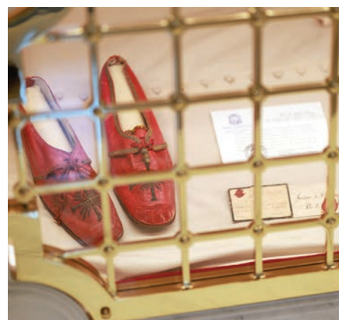
Second-class relics of St. Pius X's papal cassock and shoes are displayed for veneration behind a brass grille under the altar of the side chapel dedicated to him.