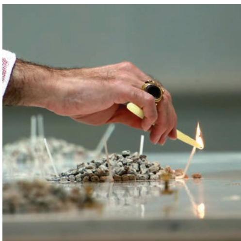
The altar is consecrated with Holy Chrism and incensed as at Mass. Five grains of incense are laid in the form of a cross upon the places the bishop has anointed.