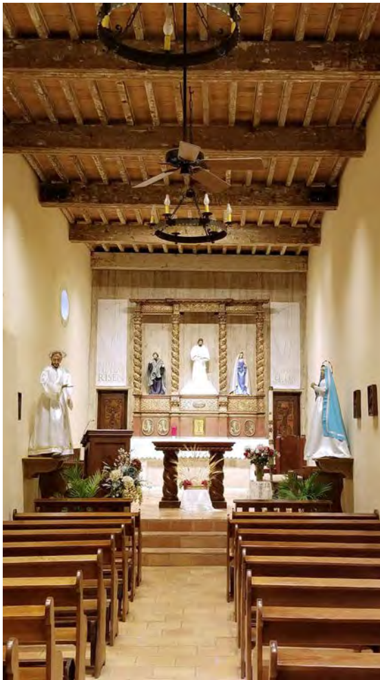
Mission San Juan Capistrano was founded in 1731 by Spanish Catholics of the Franciscan Order on the eastern banks of the San Antonio River. The first primitive capilla (chapel) was built out of brush and mud.

A small but zealous group of faithful undertook the San Antonio Missions Pilgrimage on Saturday, May 18, 2019. The pilgrimage began at Misión Nuestra Señora de la Purísima Concepción de Acuña which was established in 1716 in East Texas. Founded by Franciscan friars, this is the best preserved of the Texas missions.