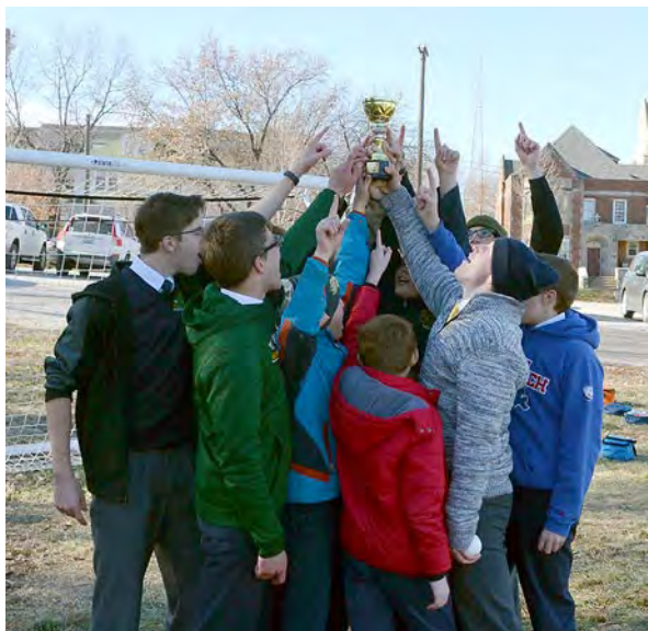
At St. Vincent de Paul Church in Kansas City, The North American Martyrs Intramural Whiffle Ball Tournament was won by the Flying Antelopes, defeating the Ugly Ducklings 21-19.