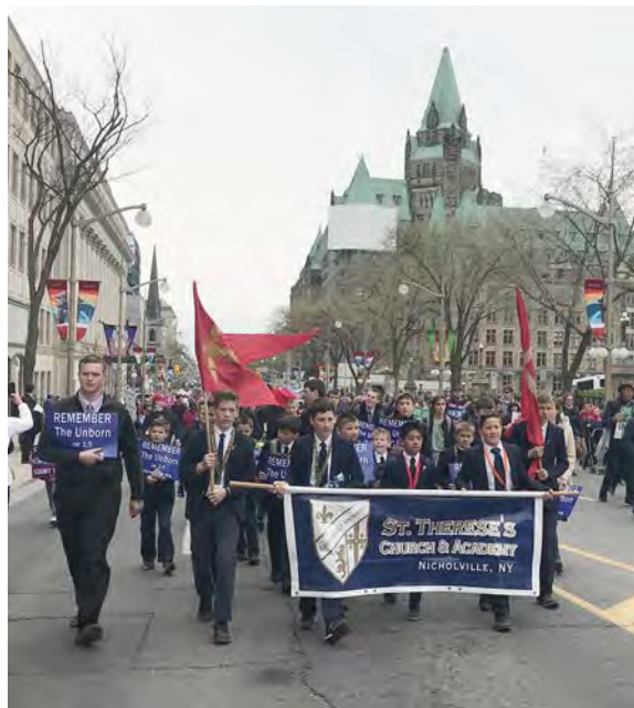
On May 9, 2019, St. Therese Academy in Nicholville, NY made the trek north of the border to participate in the Canadian March for Life in Ottawa, ON.