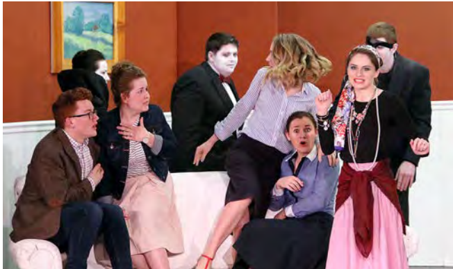
In April, the St. Mary's College drama club staged an adaptation of Oscar Wilde's famous short story "The Canterville Ghost."