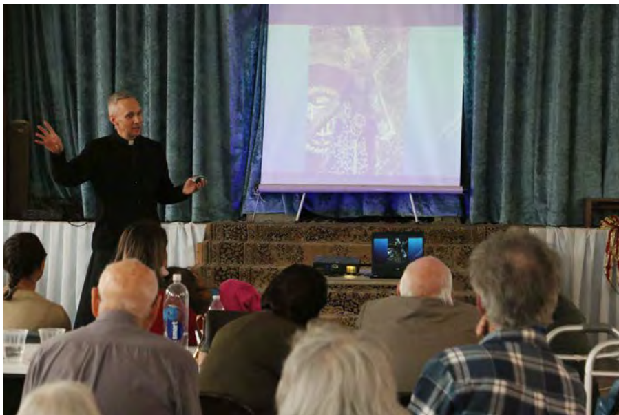
The parishioners of Jesus and Mary Chapel in El Paso, TX celebrated the feast of St. Joseph with a dinner fundraiser and silent auction.