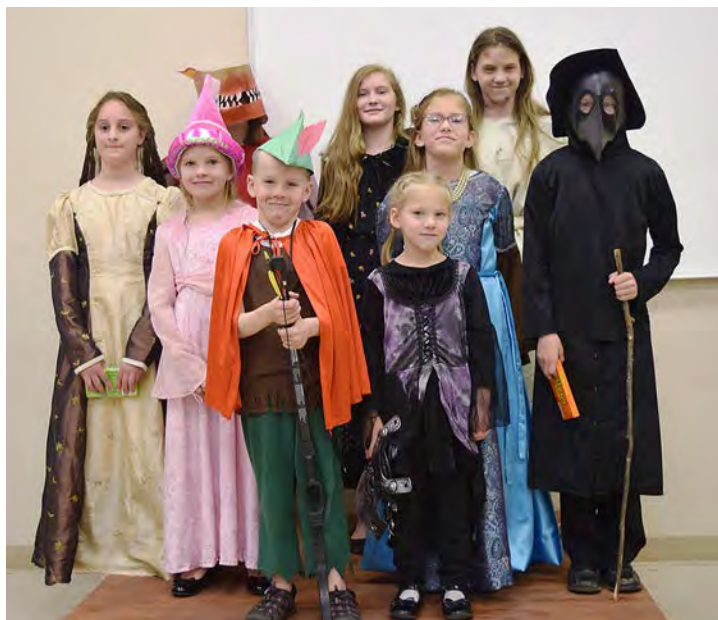
As a part of their annual School Spirit Week, the students at St. Joseph's Academy in Ray Township, MI competed for awards for the best medieval costume and the craziest hat.