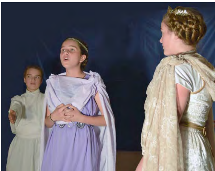
The Spring Pageant at St. Joseph's Academy (MI) included a performance of the Greek tragedy, Iphigenia in Aulis by Euripides by the 5th and 6th grade classes.