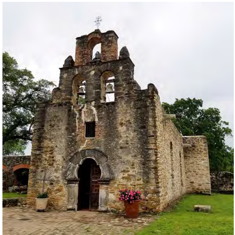
Misión San Francisco de la Espada was established in 1690 near present-day Augusta, TX and was a welcome sight for the weary travelers at the end of the pilgrimage.