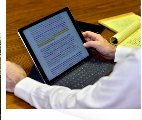
"Why should we use less intelligence than worldly people to organize our ministry...?"