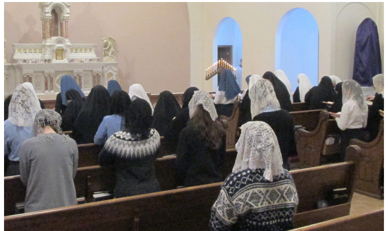
(Below) Assisting at Tenebrae with the Sisters in Browerville.