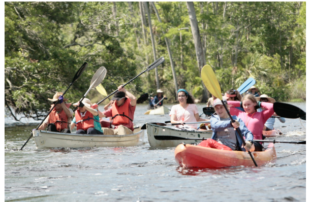
Pilgrims walked and canoed over 23 miles on certain days along busy highways and through secluded forests.