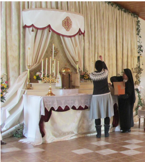
(Left) Helping decorate the Holy Thursday altar of repose.

Sisters to help them better appreciate the liturgical functions, and during their free time, many of them helped to prepare the ceremonies. Some remarked they feel more comfortable now offering their help in enhancing the beauty of the altar for future feast days in their own parishes.