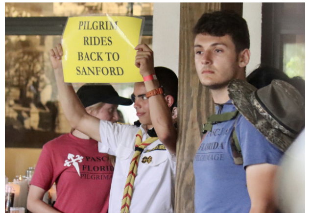
Group photo at the fort in St. Augustine at the end of the long and difficult journey.