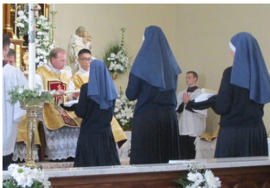
(Left) Postulants advance to receive the habit. (Below) The wise virgins with their lamps lighted.

ceived the religious habit of the Sisters of the Society Saint Pius X, four second-year novices had the joy to pronounce their Religious Profession, and four Sisters made their final vows, while several other Sisters renewed their vows. It was a day of graces and blessings for the Sisters and for the families and young ladies who came from all over the country, from Canada and from overseas for the occasion.