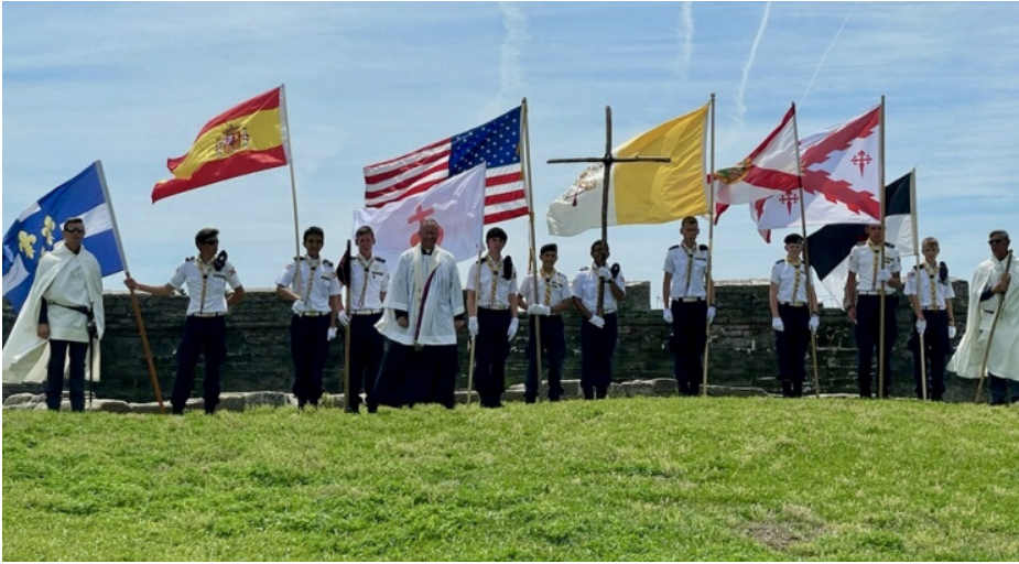
The cadets led the way from Sanford to St. Augustine waving their flags and banners.