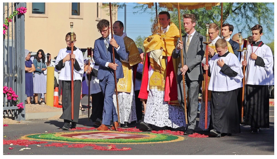
Christ the King procession at Our Lady of Sorrows in Phoenix, AZ.