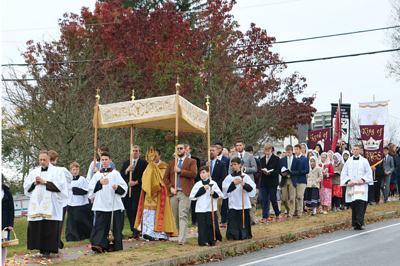
On the Feast of Christ the King, Blessed Virgin Mary Church in Syracuse, NY held a Eucharistic procession and recited together the Act of Consecration of the Human Race to the Sacred Heart of Jesus.