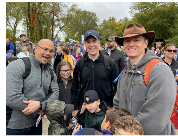
St. Vincent's once again hosted the Starkenburg Pilgrimage from October 12 -14, 2023. The pilgrimage was organized by the Legion of Mary, and supported by the Scouts and many volunteers.