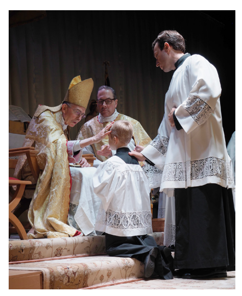
Confirmations took place in Weston, Florida with faithful from Our Lady of Victory (Davie), Queen of the Most Holy Rosary (West Palm), and Our Lady Queen of Angels (Fort Myers) chapels.