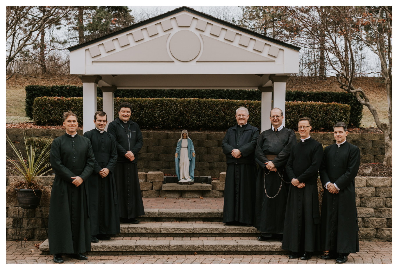
The priests take time for a photo shortly after the conclusion of the event.