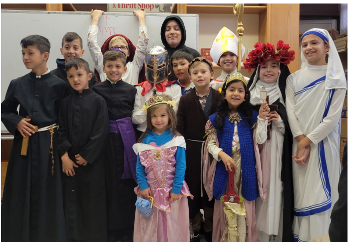
St. Anthony of Padua in Caldwell, NJ held a Christmas pageant this year to add to their celebration of the feast.