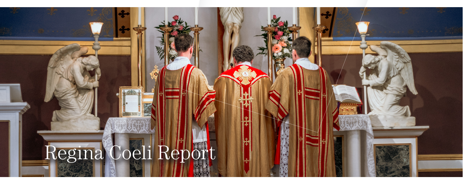
Number 313 December 2023 - January 2024 ::