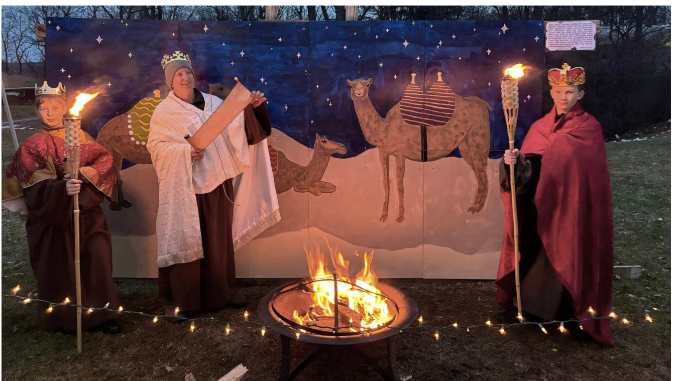
St. Michael's Chapel in DePere, WI hosted a live Nativity scene in December 2023. They were blessed with mild weather that weekend and the event was a big success. Many parishioners donated their time and talent—from sewing costumes and building the sets, to acting as the Holy Family, angels, kings, shepherds, townspeople, etc. It was attended by parishioners as well as area residents and friends. They also had live sheep, donkeys, and steers in the stable, replicating as much as possible the cave at Bethlehem.